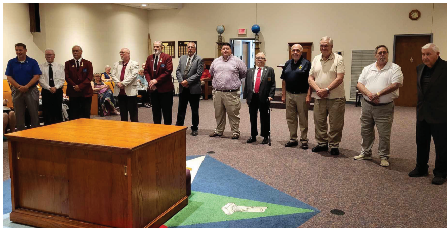
Past Masters attending Past Masters Night on August 29.